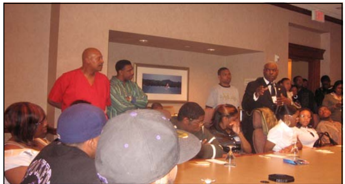
Alumni address parents and prospective ASU students at the meet and greet session held during the 21st Midwest Regional Conference.